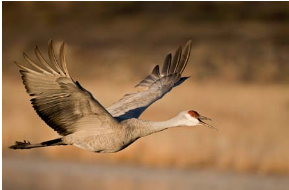
Photo taken on one of my Dec. tours to White Sands/Bosque

Contact: 303.791-9997; www.russburdenphotography.com