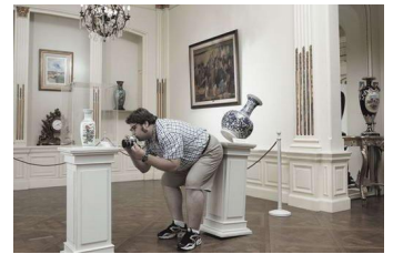
Don't let anything get in your way of capturing that one perfect image.