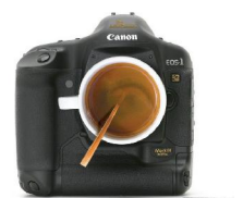
You can always turn your camera into a cup holder.