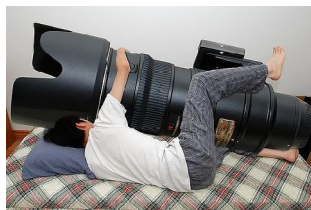
Learn to love your lens.