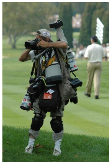
Always having the right equipment at hand is essential for good photography

Please note: As unprofessional has I am it is hard for me to give you any advice, but I will.