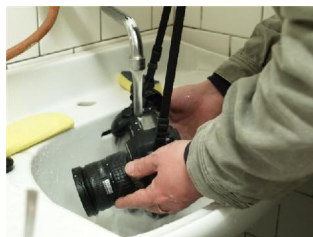
How to test your camera weather proofing.