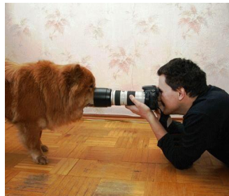
Get as close as you can to your subject.