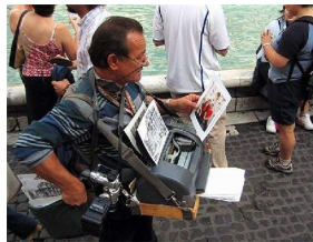
Be prepared for anything and everything that may come your way.