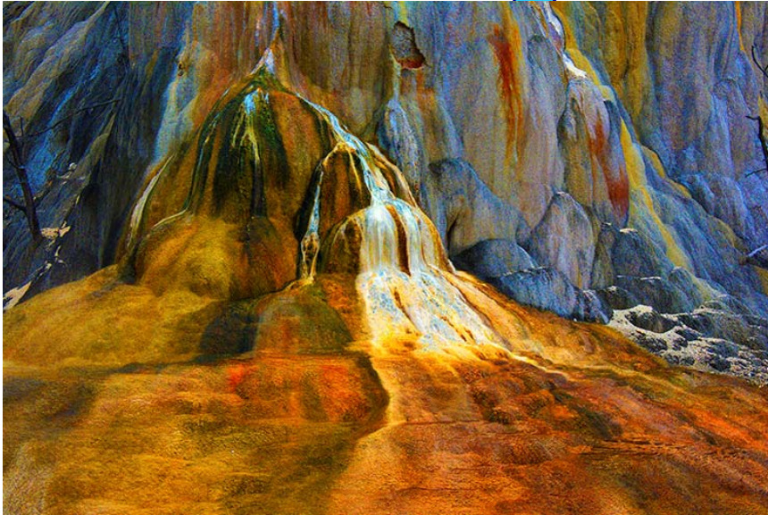
Mammoth Hot Springs